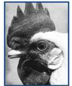
After 18 Weeks

Shown is 7 day old chick after Precision Debeaking. Note the slightly longer lower beak.